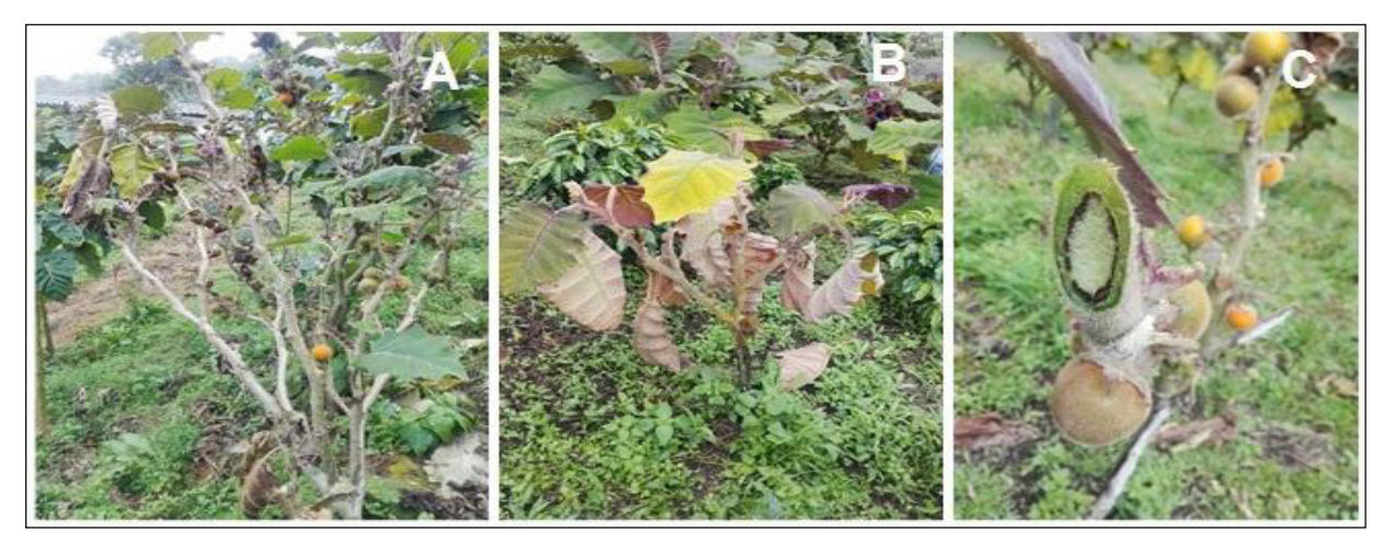
Figure 1. Symptoms observed in the field in different municipalities of the Department of Nariño. A) Foliage wilt B) Dwarf and chlorotic plants C) Necrotic vascular tissue with brown coloring.

Morphological characterization oxysporum. The macroscopic morphological identification of the 20 isolates showed colony (GR) growth rates ranging from 7 to 21 days. For mycelium color, type, and medium color, different shades ranging from whitishpink, purplish-white to intense purple and intense pink were observed. These results are similar to those obtained by Nelson et al. (1994), Betancourth et al. (2005), Leslie and Summerell (2006), Robles-Carrión et al. (2016), Arellano (2018), Leyva-Mir et al. (2018), Retana et al. (2018), who state that these mycelial colors are a characteristic feature of F. oxysporum since it displays great color variation on PDA medium.